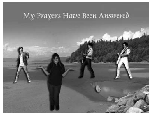
An example of student work created in a Communications Technology class at Jean Vanier's Take Our Kids to High School Day .

Student council and student volunteers were an integral part of the day. They were responsible for ensuring the success of the classroom rotations, leading the groups of students from one activity to the next and ensuring participation by all the students. They also organized and ran the student scavenger hunt. Departments selected student volunteers to help facilitate the classroom lessons, highlighting the many talents of our community.