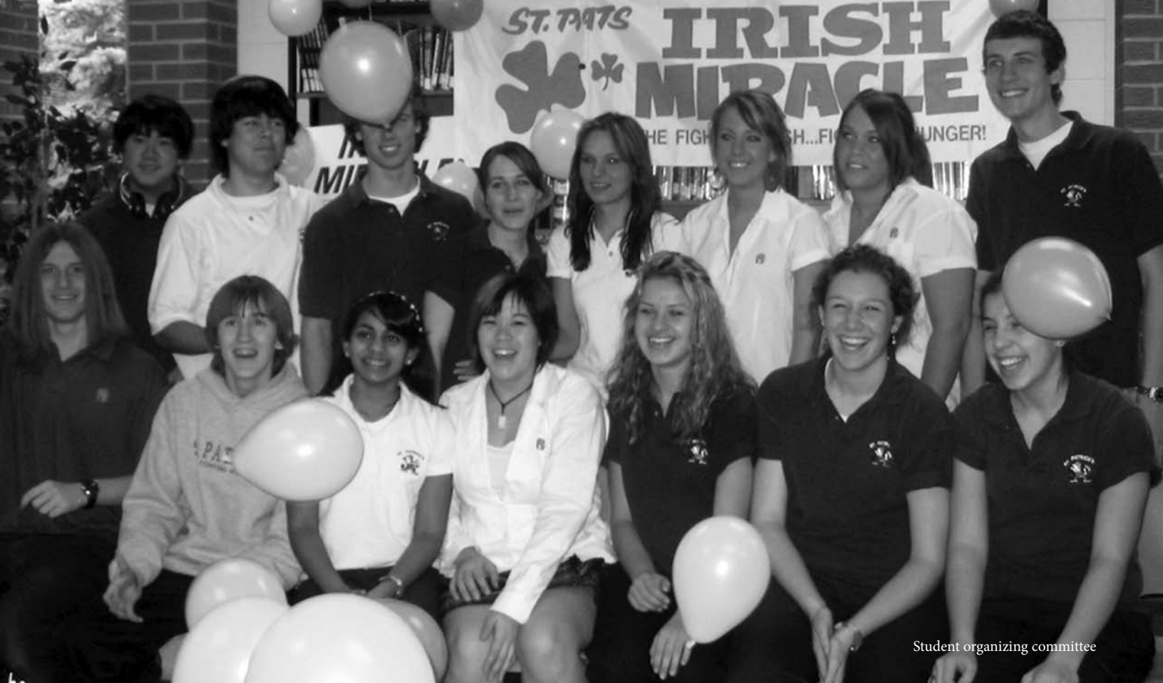
Student organizing committee