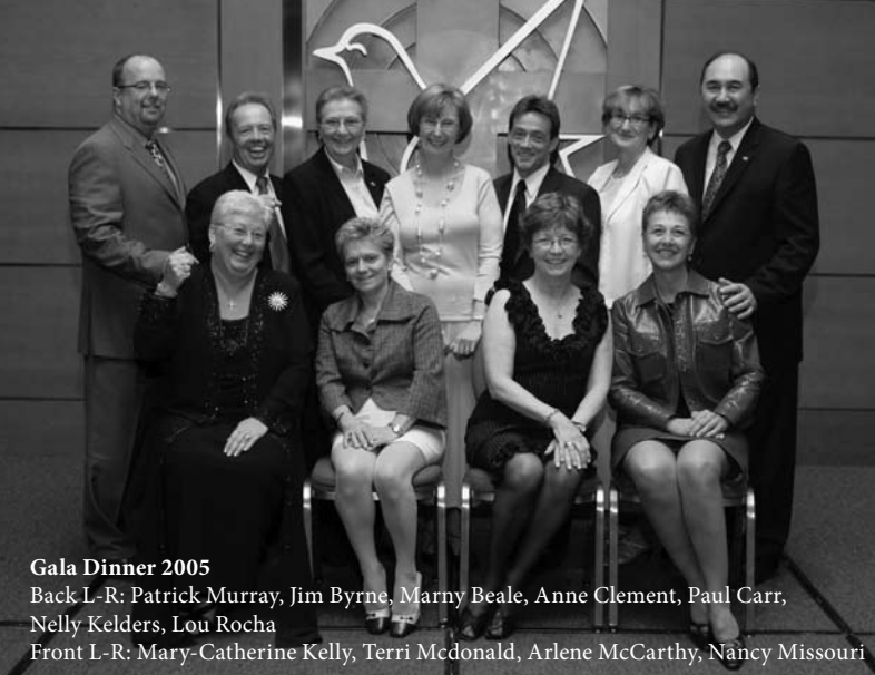
Gala Dinner 2005