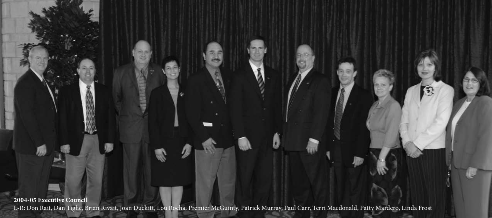
2004-05 Executive Council