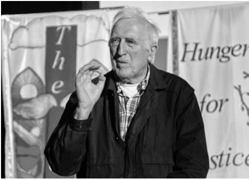
Jean Vanier, Youth Forum Speaker