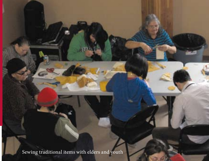
Sewing traditional items with elders and youth

The Great Moon Gathering is not only a professional development opportunity; it is also a cultural celebration. The theme for this year's conference was Reclaiming Our Cultural Traditions for Future Youth Success . The conference began with a traditional opening ceremony including a smudge ceremony, prayer and honour song. The honour song was performed by the High Ridge Singers, a traditional drumming group made up of young men from the Moose Cree First Nation. All conference participants shared a community banquet dinner, where we were treated to caribou, white fish and Indian pudding; a dense fruitcake covered in warm custard. During the feast, we listened to a high school student from Attawapiskat, who was given the name Earth Walker by the Elders, because she walked from Cochrane, Ontario to Hinton, Alberta to raise awareness for her community's need for housing. Close to 100 people were left homeless after a sewage backup this past summer contaminated their homes. Youth talent from all of the communities participating in the Great Moon Gathering entertained the