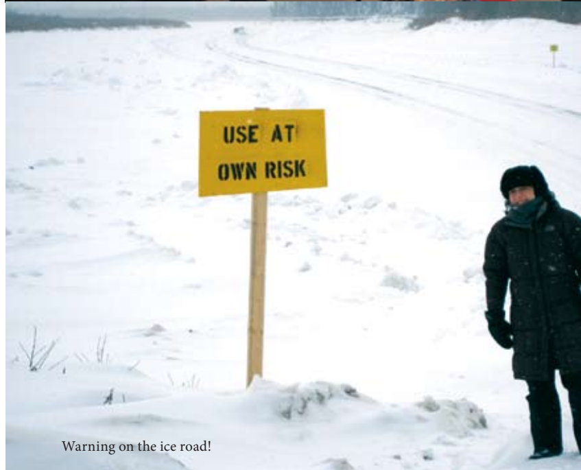
Warning on the ice road!

group after the feast. Throughout the conference, we were touched by the compelling stories of perseverance by youth, educators and families who are working to reclaim language and culture after the travesty of residential schools.