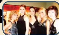
The Song Project